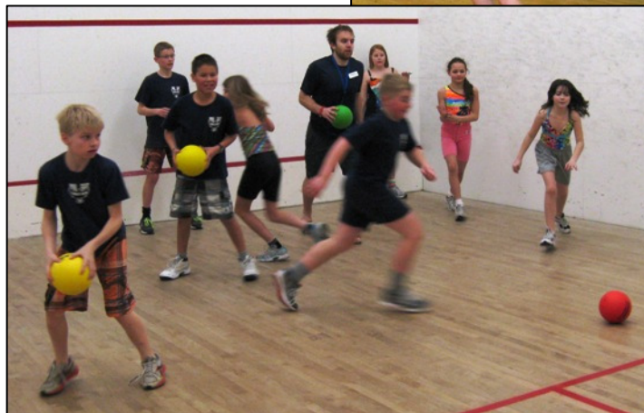
Grade 3/4 at the Kakabeka Curling Club