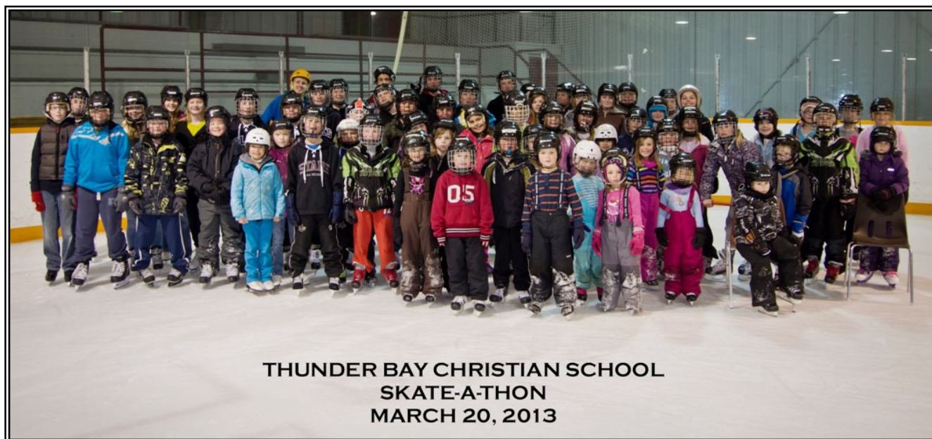
THUNDER BAY CHRISTIAN SCHOOL SKATE-A-THON MARCH 20, 2013