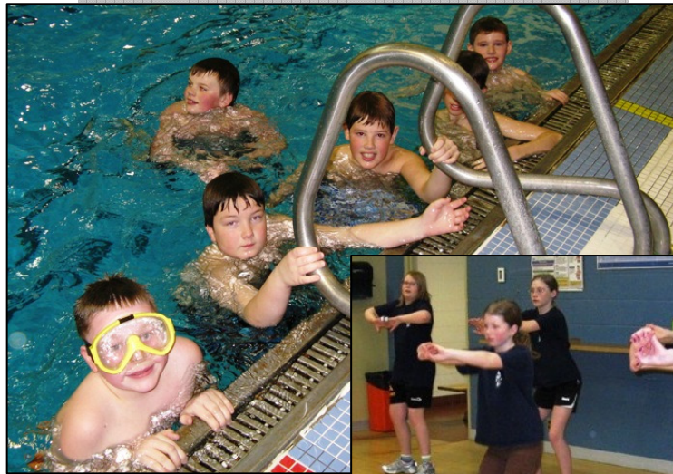
Grade 5 /6 at the Canada Games Complex

These activities are partially funded by money raised through the chocolate bar and magazine sales each year and also supported by parents. Thank you to everyone for making these excursions possible.